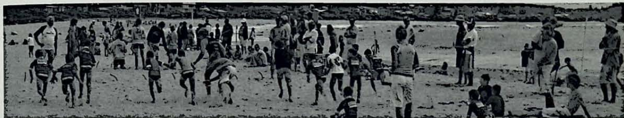
Nipper Mentoring Day – Beach Flags