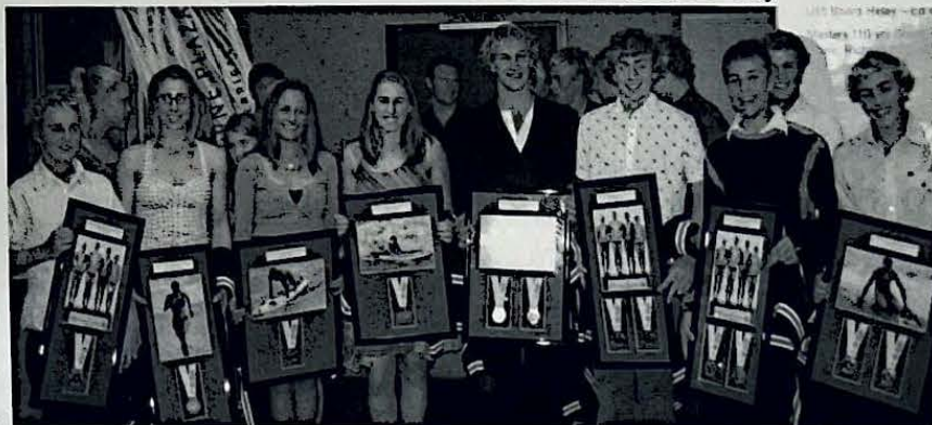
Australian Gold Medalists