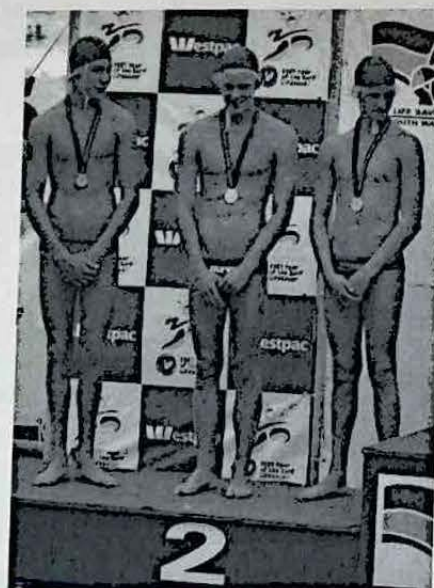
State Silver U17 Male Board Relay