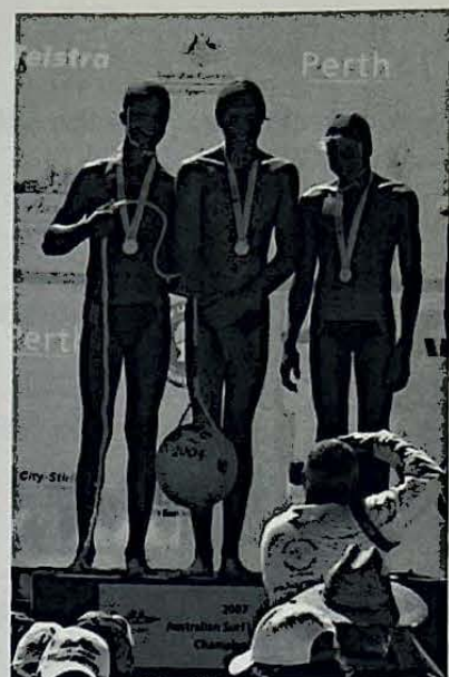
Australian Gold – U15 Board Relay