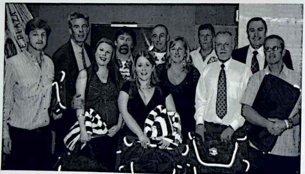
Terrigal Patrol Captains at Awards Night