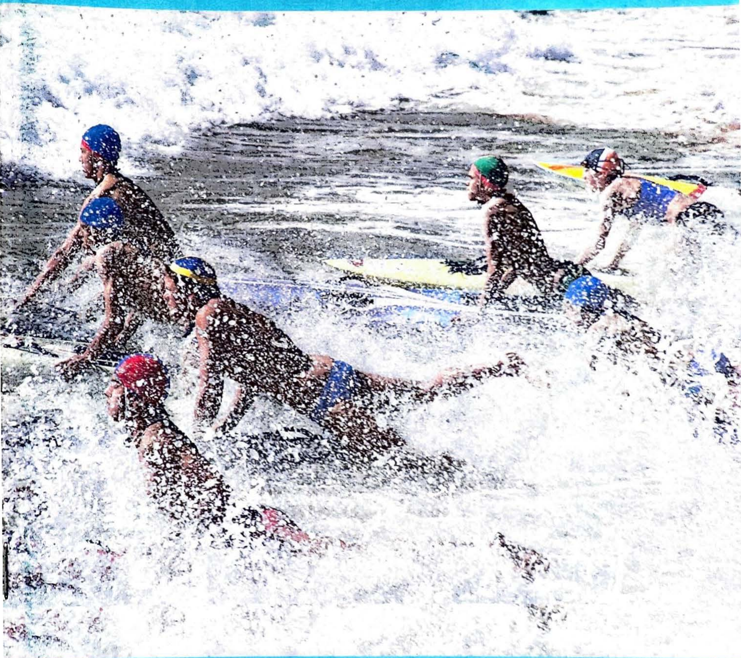
Photo: NSW Endurance Titles Held at Terrigal Beach October 2006