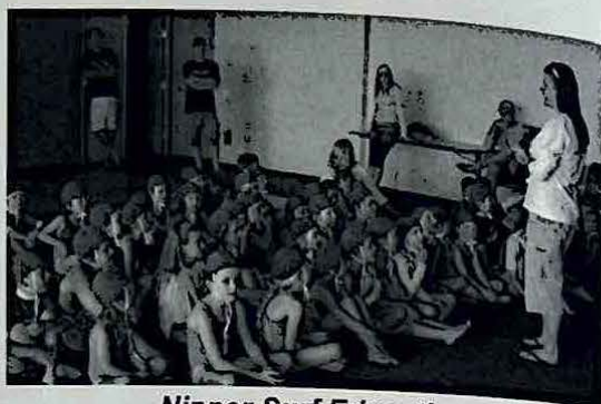
Nipper Surf Education