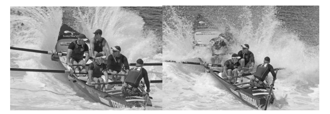
Terrigal Masters Mens Crew at the World Masters Games – Sydney October 2009