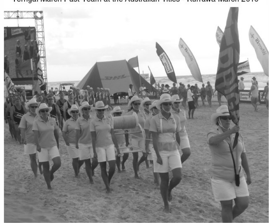
Terrigal March Past Team at the Australian Titles - Kurrawa March 2010