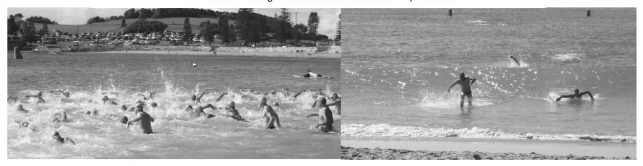
10<sup>th</sup> Annual Terrigal Ocean Swim Classic – April 2010