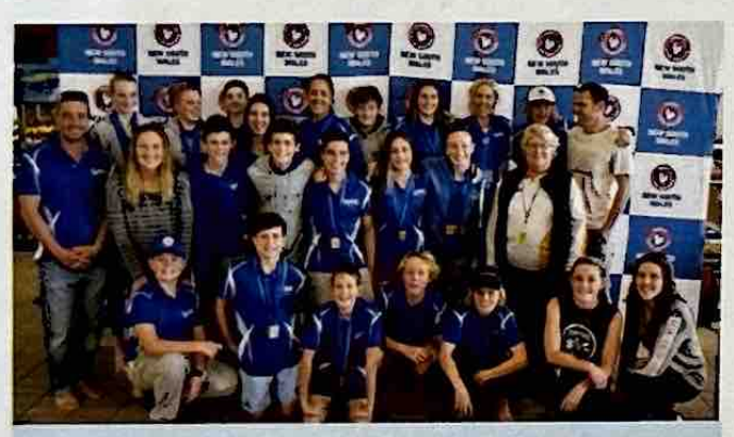
Our outstanding Pool Rescue Team

No season could be accomplished without a huge amount of input from Coaches, First Aid Officers, Patrolling members, IRB crew, Parents, and other helpers of all types. To them I express my utmost gratitude.