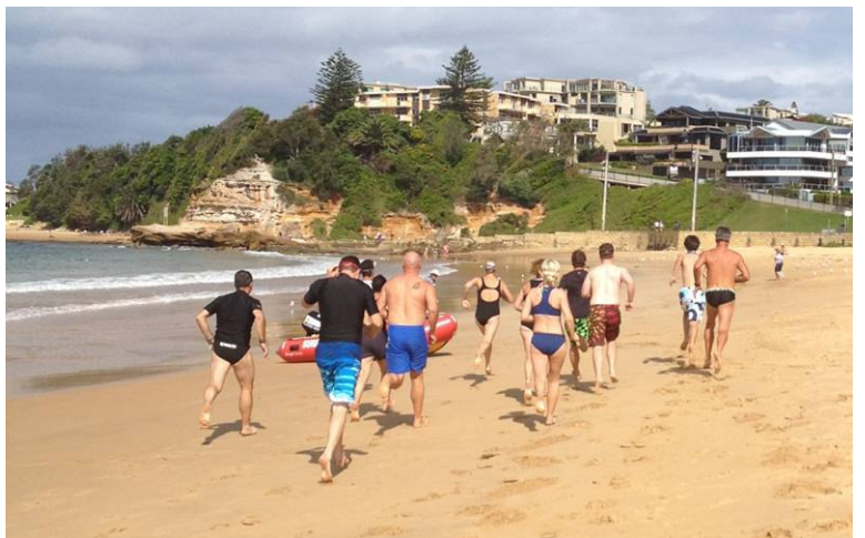
New Lifesavers in Training