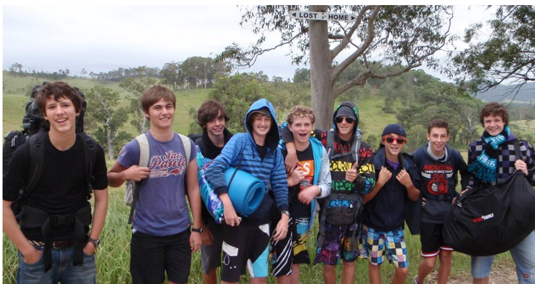
Duke of Edinburgh Participants 2011.12