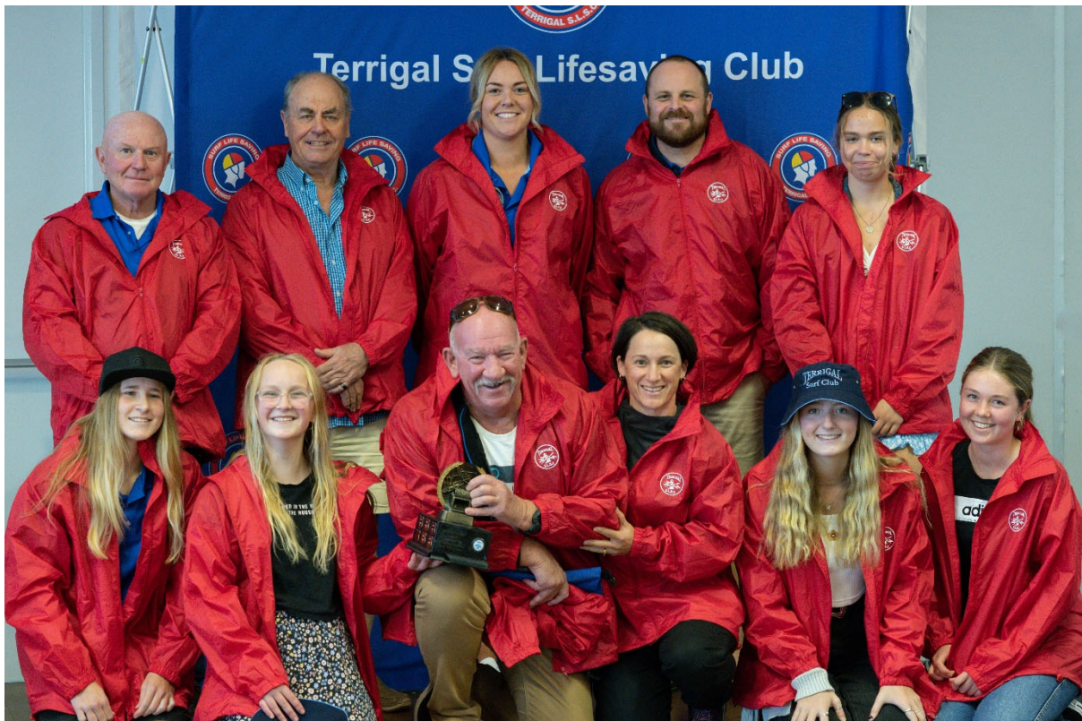
Terrigal SLSC Patrol of the Year 2020/ 2021