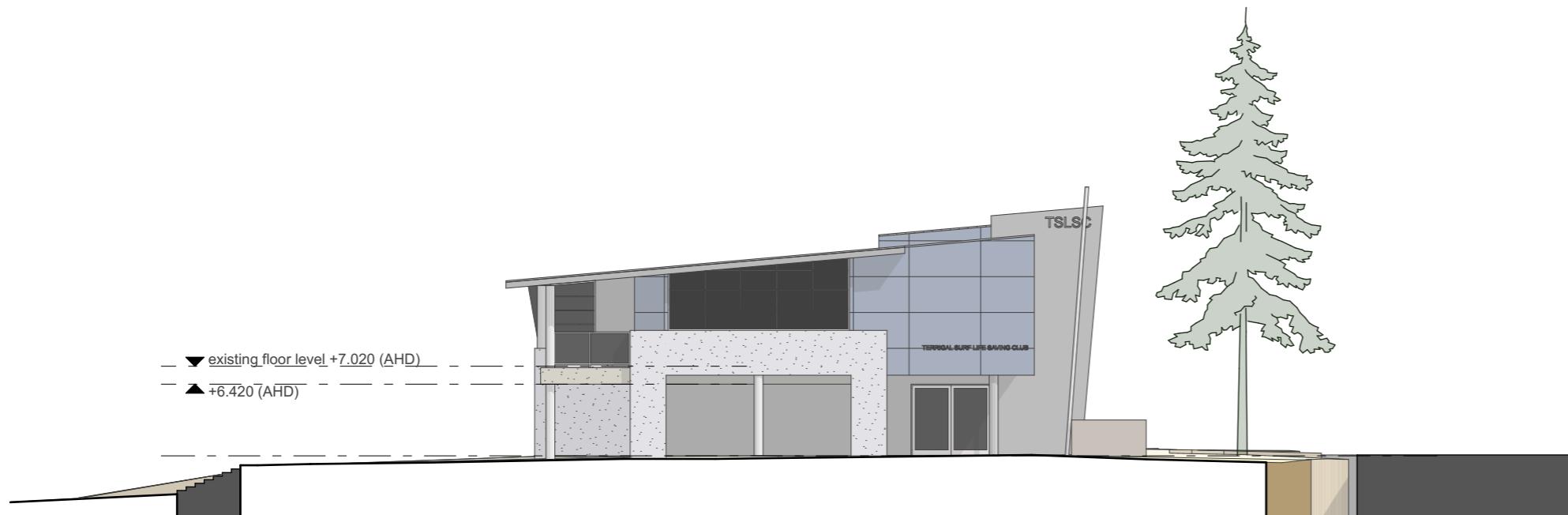
NW D003 North West Elevation 1:200