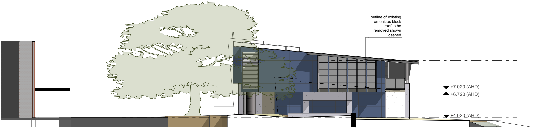
SE D003 South East Elevation 1:200